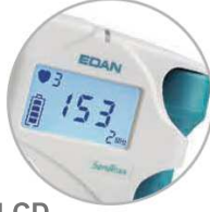
Back Light LCD شاشة LCD مع إضاءة