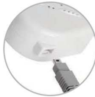
Interchangeable Waterproof Probe مجس مقاوم للماء قابل للإستبدال