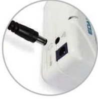
Compact Battery Charger شاحن بطارية مدمج